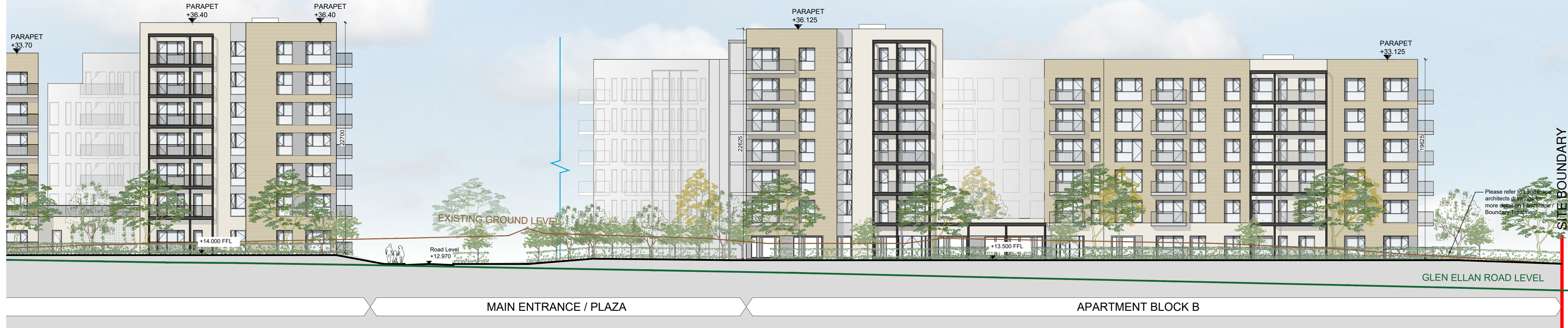
SECTION A-A CONTINUED