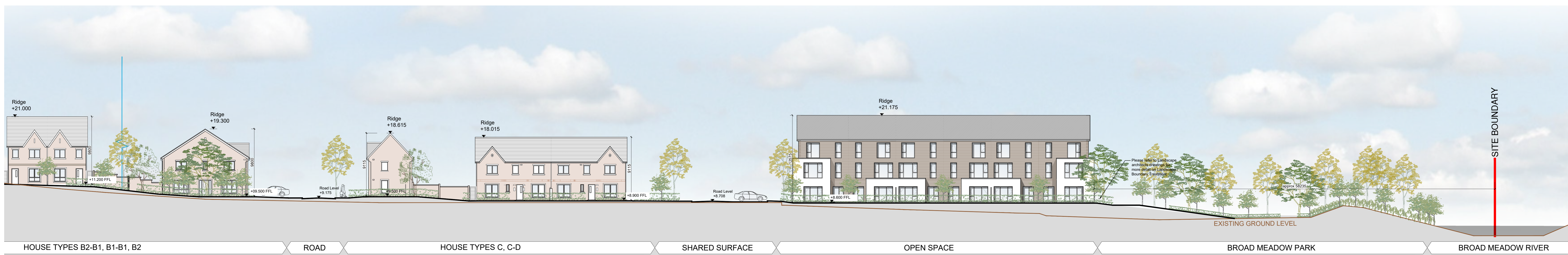
SECTION B-B CONTINUED